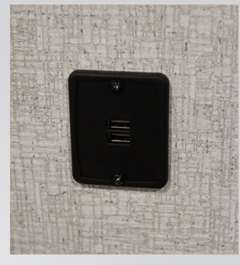
USB PORTS THROUGHOUT