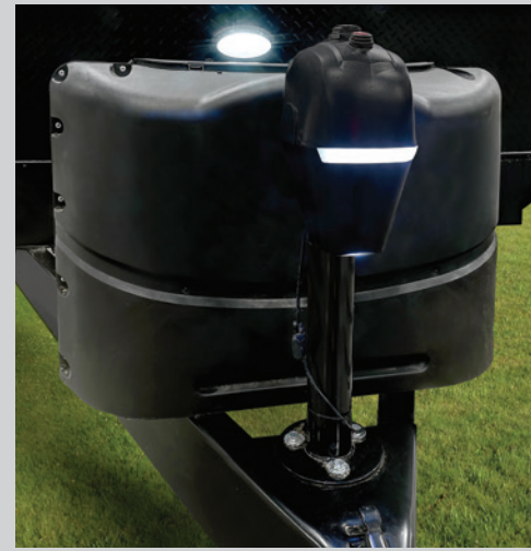
POWER TONGUE JACK WITH LED LIGHT