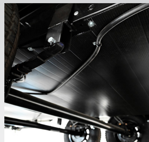
FULLY ENCLOSED AND HEATED UNDERBELLY