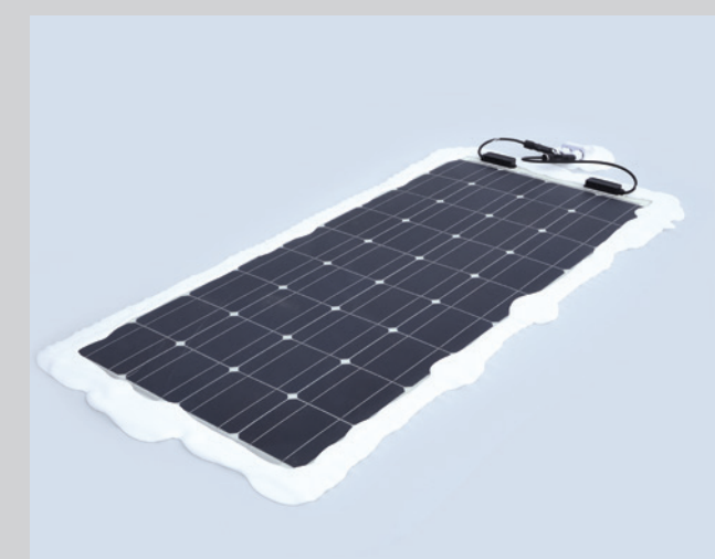
ROOF MOUNTED SOLAR PREP

True Solar Prep roof mounted MC4 with pre wire