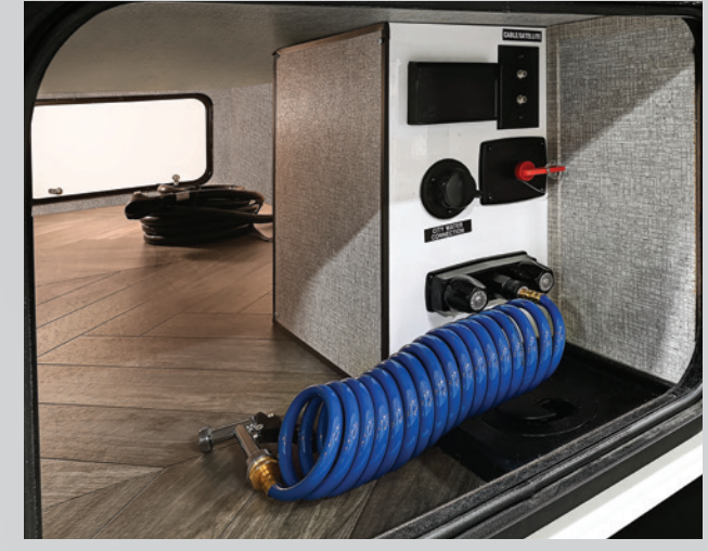
UNIVERSAL DOCKING STATION

Features hot & cold shower, 110V recept, city water connection, battery disconnect, SAT/Cable connections & motion light