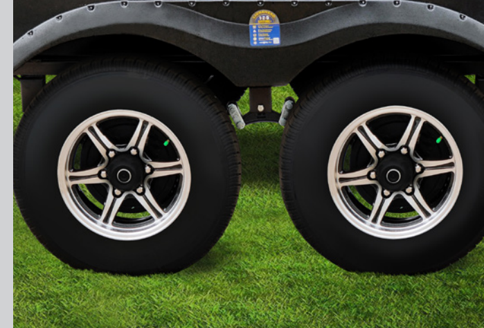
GOODYEAR® "ENDURANCE" TIRES

Features hot & cold shower, 110V recept, city water connection, battery disconnect, SAT/Cable connections & motion light