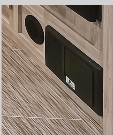
35K BTU FURNACE