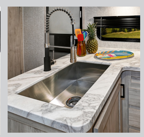
STAINLESS STEEL FARMHOUSE SINK WITH HIGH RISE FAUCET