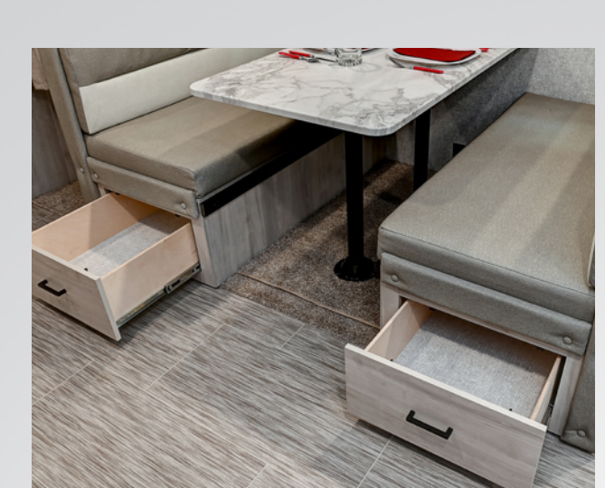
DINETTE STORAGE ON ROLLER GLIDES