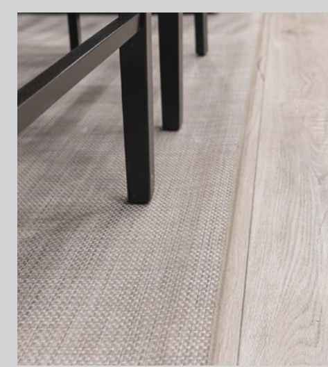
WOVEN MARINE GRADE FLOORING